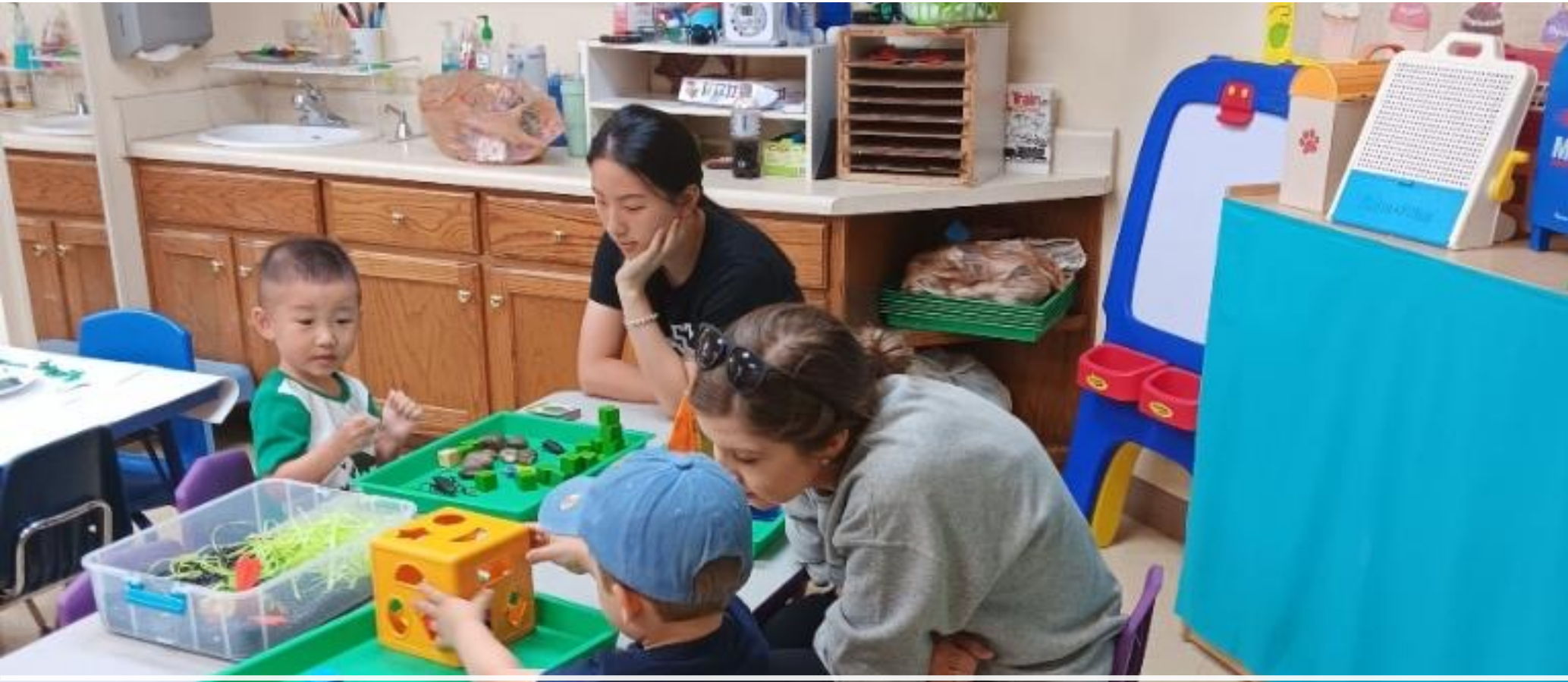
Pre-K Happenings, April 2024 Preschool Family Day