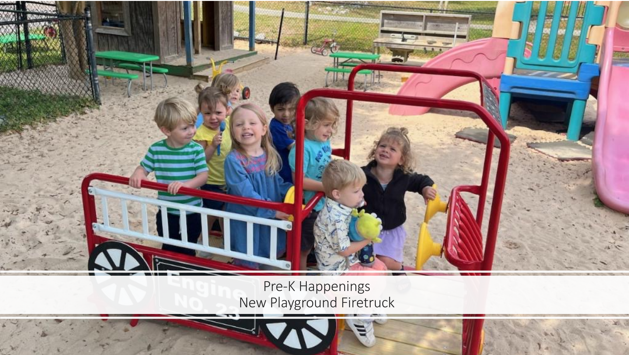
Pre-K Happenings New Playground Firetruck