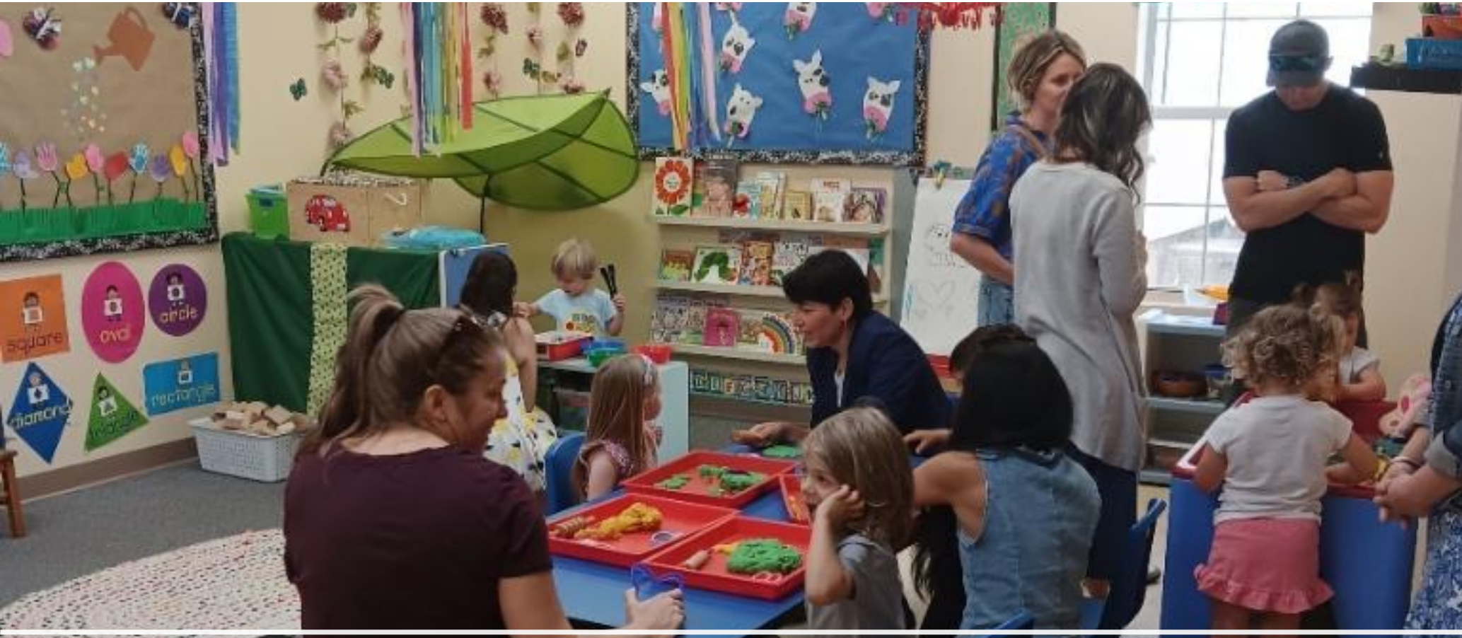
Pre-K Happenings Preschool Family Day