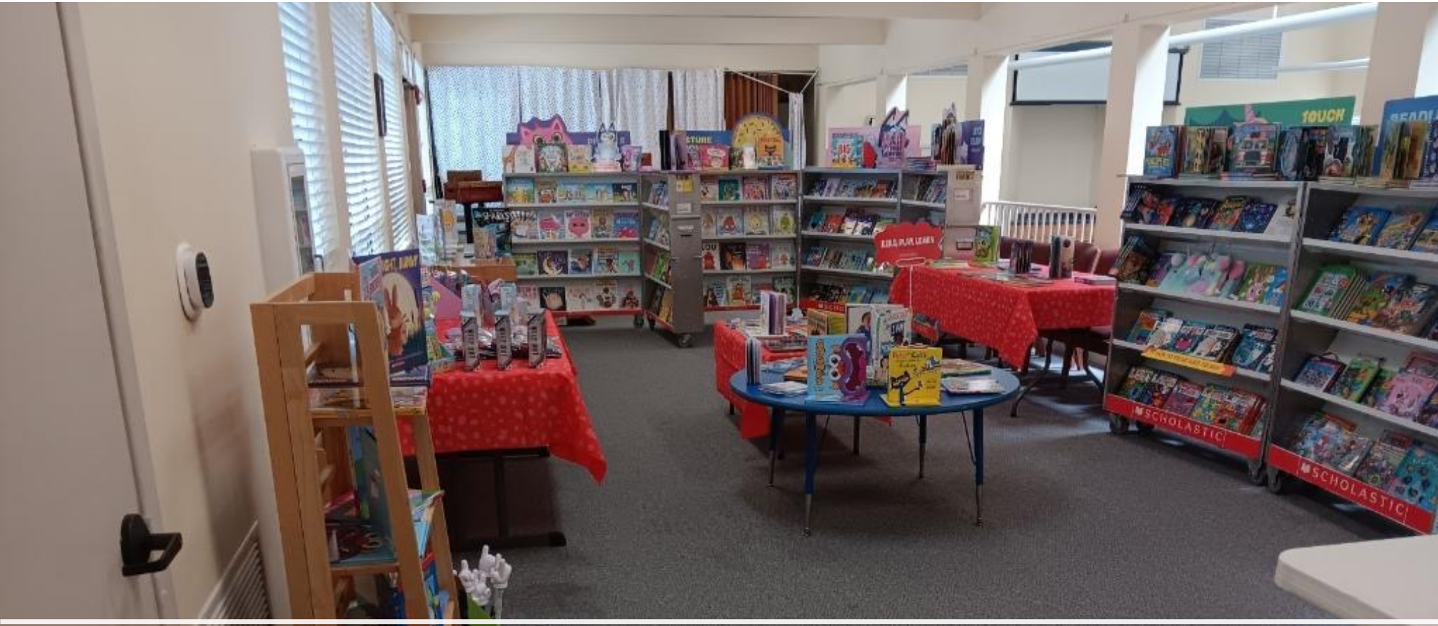
Pre-K Happenings, April 2024 Scholastic Book Fair